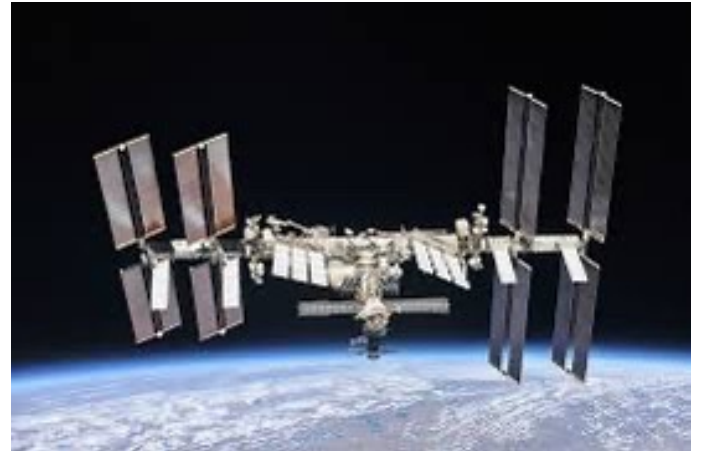
Sky Event Almanacs